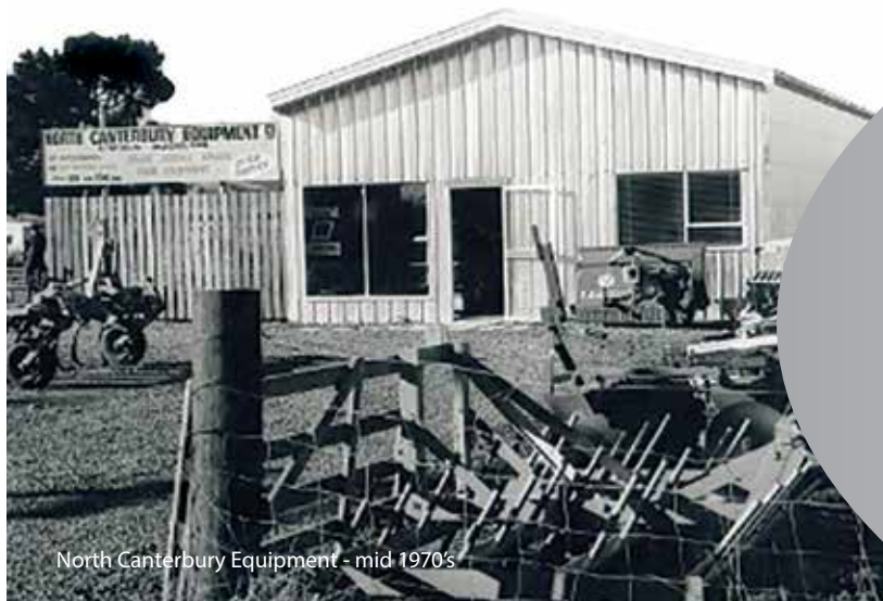
North Canterbury Equipment - mid 1970's

We are located on more than half a hectare on State Highway One in Amberley, with a 1600sqm building which consists of: offices, showroom and the service workshops. The core of our business is buying and selling of all farm machinery, both new and used sourced from both New Zealand Manufacturers and Overseas.