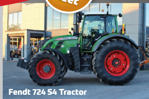
Fendt 724 S4 Tractor

Talk to us about hire-to-buy options where we can offset some of your hire payments against the new price of the hired machinery.