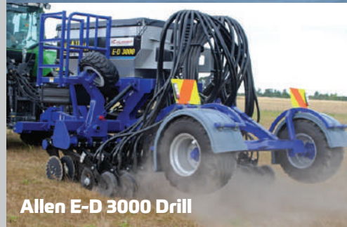
Allen E-D 3000 Drill