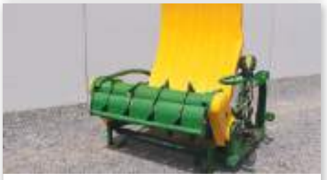
Hustler Chainless 2000 Balefeeder Feeds round and squares of hay, straw or balege with ease. This machine has only had 3 seasons of use and is extremely tidy! $8.045 +GST