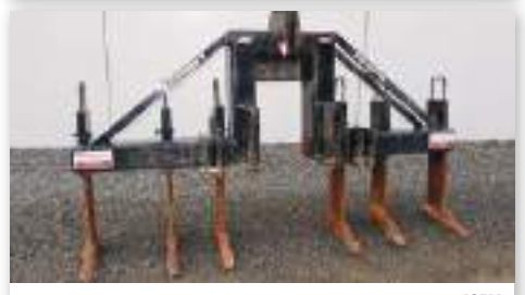
James 6 Leg Pre-Ripper 3m 60521 Legs are all in top condition with Ni-Hard wear strips on the front. 3PTL mounts on the rear. $7,000 +GST