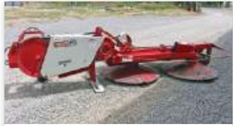
60688 Reese UFO 2400HL 3ptl Hay Mower Hydraulic offset lift for ease of transport & enables mowing without running over your crop. 2.4m cut for fast work. $7,000 + GST