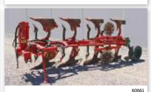
Vogel & Noot MS850 4 Furrow Plough Reversible, hydraulic variable width, rear skeiths, skimmers on all blades & rear transport wheels. $12,000 +GST