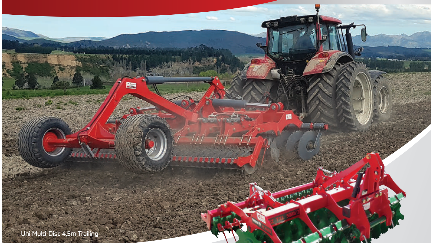
Uni Multi-Disc 4.5m Trailing